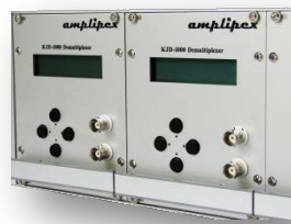
KJD-1000 Demultiplexer units