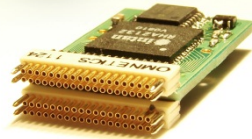
HS2 64 Channel headstage with Omnetics connectors